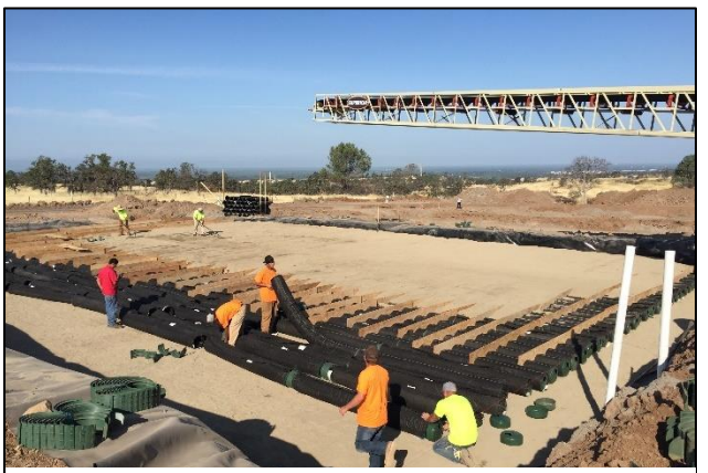
Fig. 5 – FEMA work camp wastewater treatment system

A 100,000 gpd modified combined treatment and dispersal system was selected to serve the housing camp (Figure 5). The system was designed to receive gravity-flow influent to four, 40,000-gallon septic tanks configured in series. The effluent is then segregated into four treatment paths to facilitate isolation during maintenance. The flow is split to four, geomembrane-lined, beds performing passive, secondary wastewater treatment. Each 25,000 gpd bed contains 8,400 feet of pipe-based CTD product surrounded by system sand for a total 33,600 feet of pipe. Treated effluent is