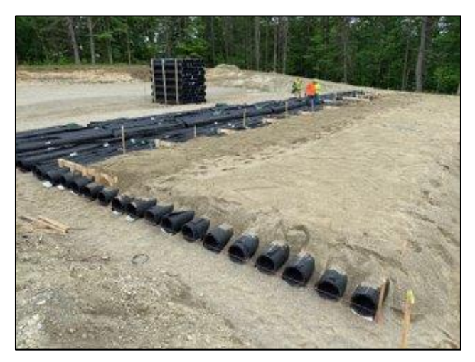
Fig. 4 – CTD system serving ski resort

In 2022, the resort upgraded its existing wastewater management system with the construction of a new 9,900 gallon per day (gpd) onsite CTD system. The system is comprised of two beds constructed using pipebased CTD technology, with each having a capacity of 5,000 gpd. Each bed consists of a pipe-based CTD technology installed within a system sand envelope (Figure 4). The system design includes discharge of the treated domestic wastewater through the bottom of the CTD system directly to the underlying native soil. Under the Massachusetts Department of Environmental Protection product approval, the system footprint could