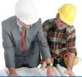
Information for Industry Professionals