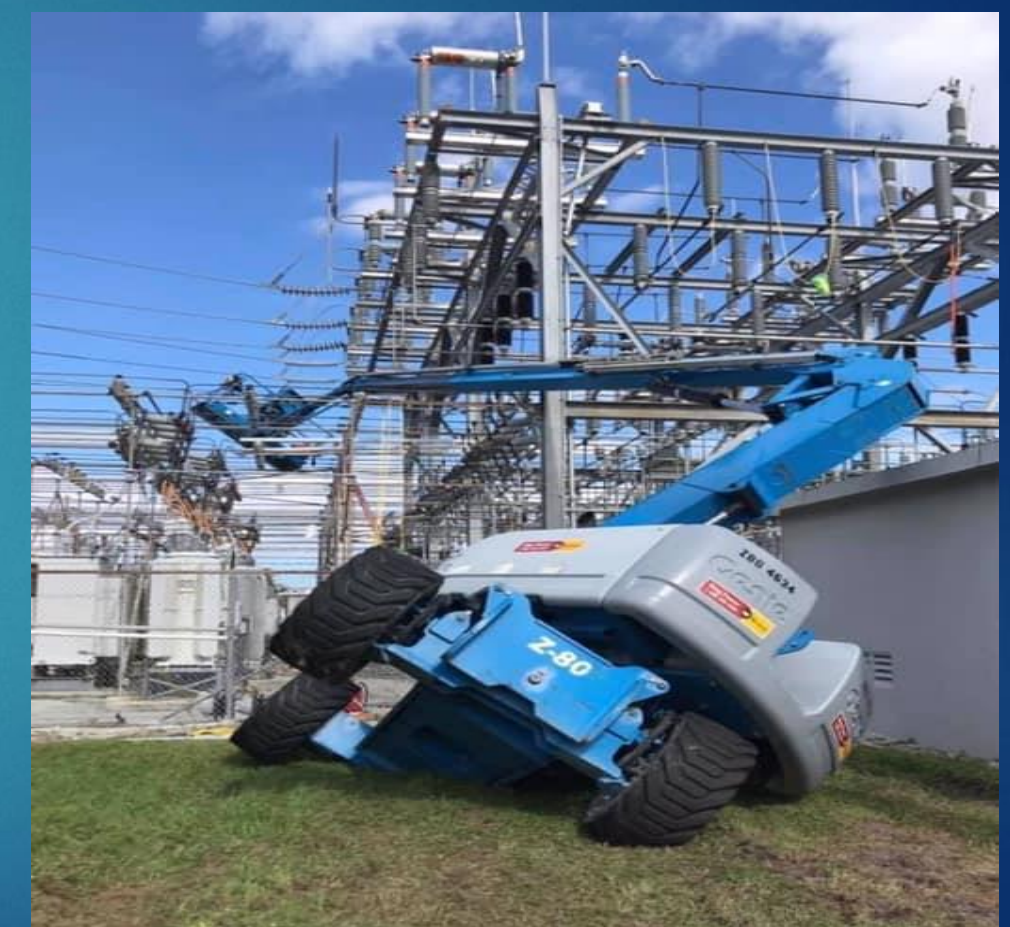
Construction lift fallen into an unmarked septic tank.