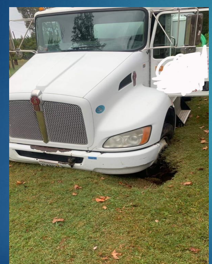
Truck fallen into an unmarked septic tank.