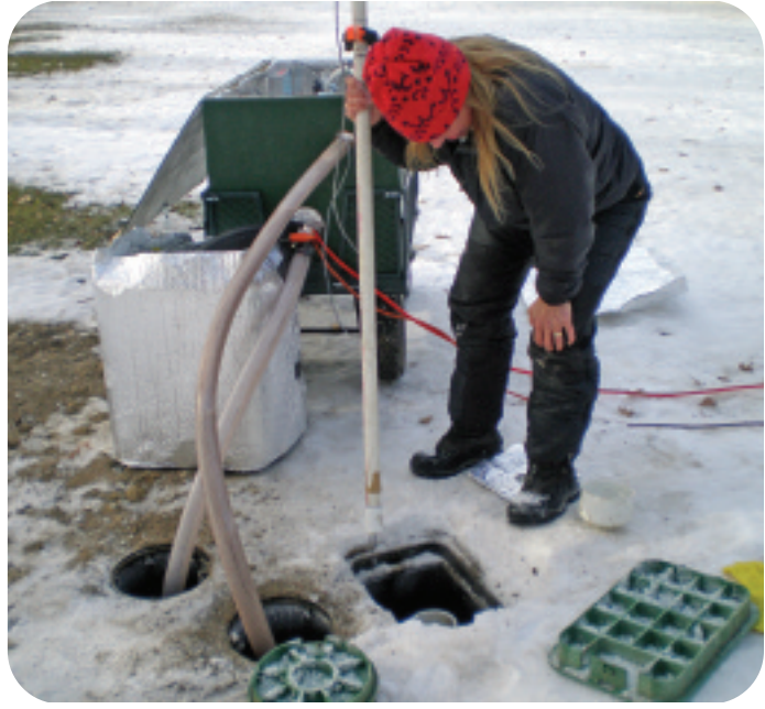
Collecting samples in frozen Minnesota